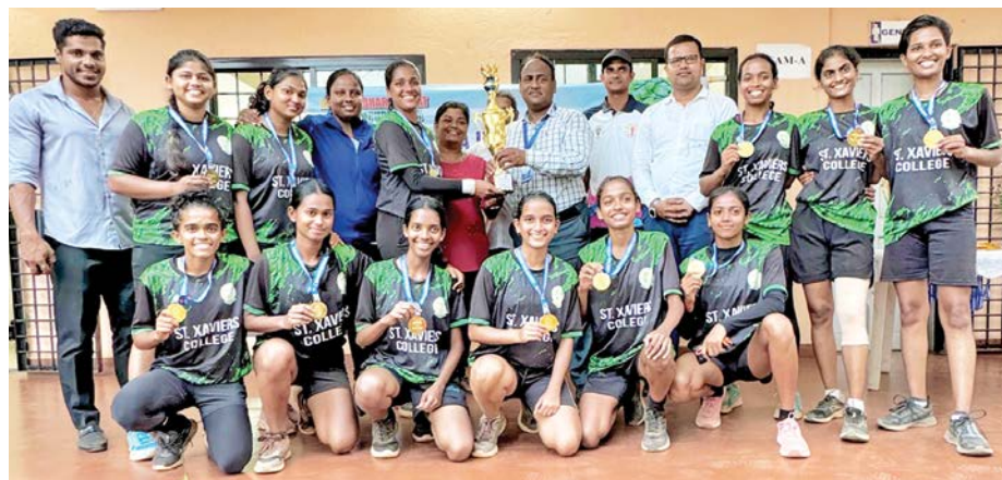
Winners St Xavier's College, Mapusa