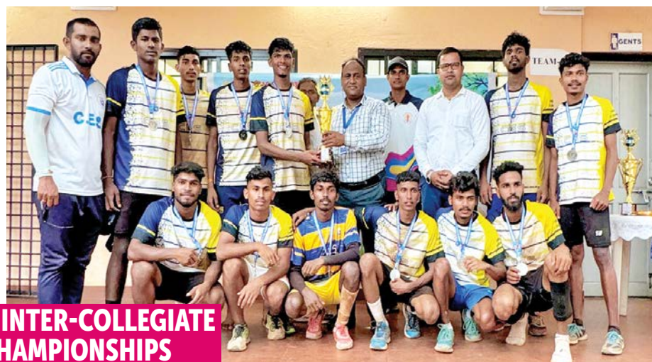
Runners-up Cunclim Educational Society's College of Arts and Commerce, Cunclim