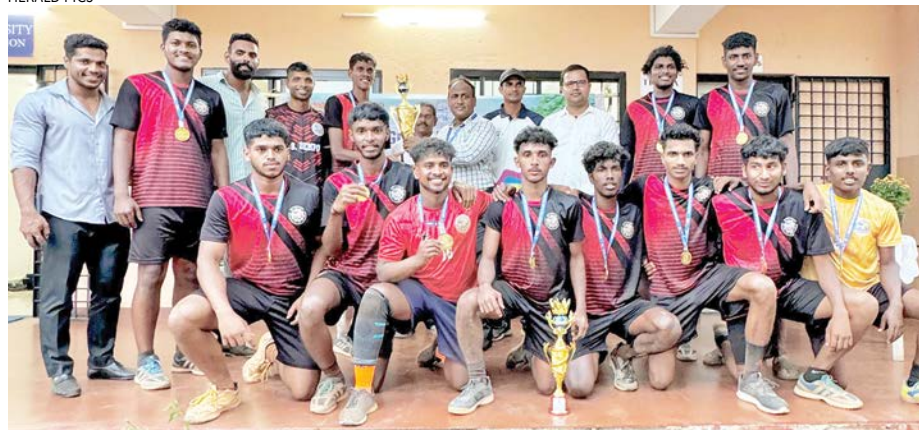
Winners Dempo Charities Trust's Srinivassa Sinai Dempo College of Commerce and Economics, Cujira-Bambolim