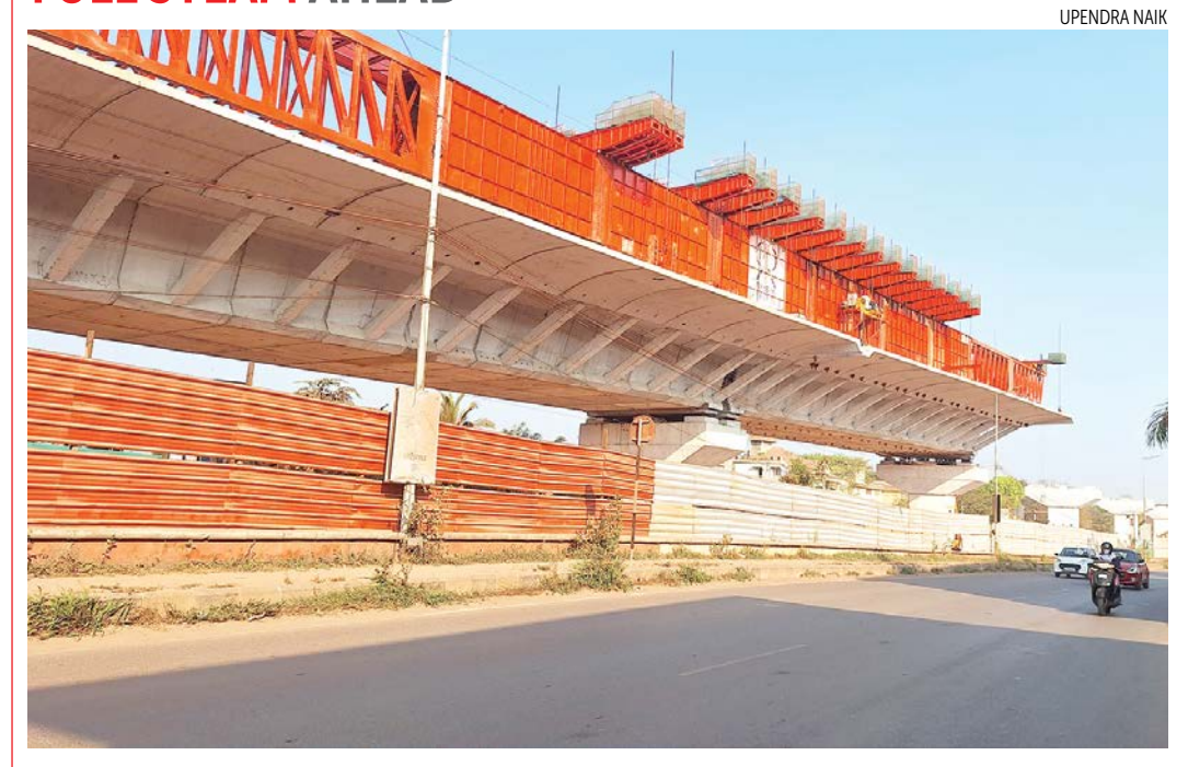
The elevated expressway in Porvorim is finally taking shape, with parts of the road laid over the pillars and construction work proceeding at a rapid pace