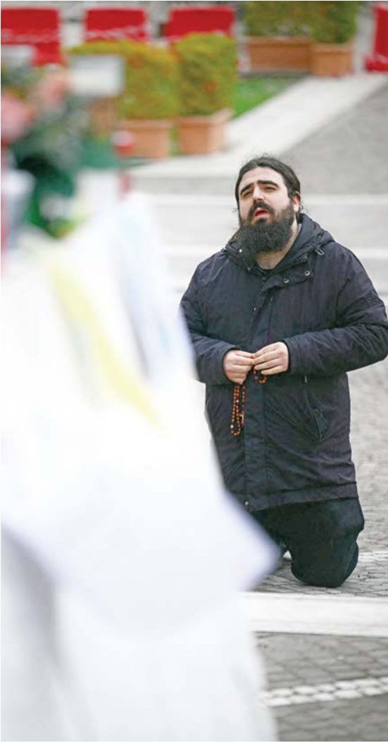
A man prays at the statue of John Paul II outside the Gemelli hospital where Pope Francis is hospitalized with pneumonia, in Rome, on Thursday

ROME: The Vatican said Wednesday that Pope Francis has shown further slight improvement as he battles double pneumonia, but doctors still say his prognosis is still guarded. A CT chest scan taken Tuesday evening showed the "normal evolution" of an infection as it is being treated. Blood tests have confirmed an improvement, according to the Vatican's late update. The slight kidney insufficiency detected a few days ago has receded, and Francis is continuing to receive respiratory physiotherapy. It was the first time the Vatican has said Francis was receiving physiotherapy to help him expel fluid from his lungs. Francis resumed work in the afternoon, after receiving the Eucharist in the morning. He was sitting upright and receiving therapy, the Vatican said, as Argentines, Romans and others have kept up the steady stream of prayers for his recovery.