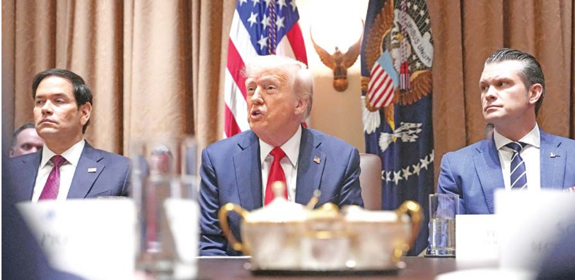
US President Donald Trump delivers remarks during a Cabinet Meeting at the White House in Washington, on Wednesday

The framework is a preliminary step toward a comprehensive pack-