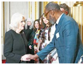
Britain's Queen Camilla (L) meets with British actor Lenny Henry to celebrate BBC's creative writing competition at Buckingham Palace, in London