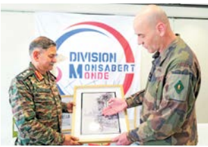
Chief of Army Staff General Upendra Dwivedi during a visit to the 3 rd Division of the French Army at Fort Ganteaume, in France