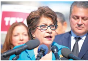
Janet Murguia, president and CEO of UnidosUS, speaks during a Congressional Hispanic Caucus news conference in Washington, DC