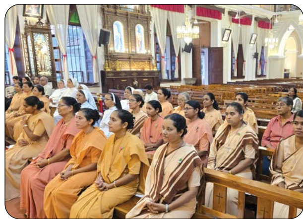
JUBILEE OF RELIGIOUS CELEBRATED IN THE ARCHDIOCESE OF GOA AND DAMAN