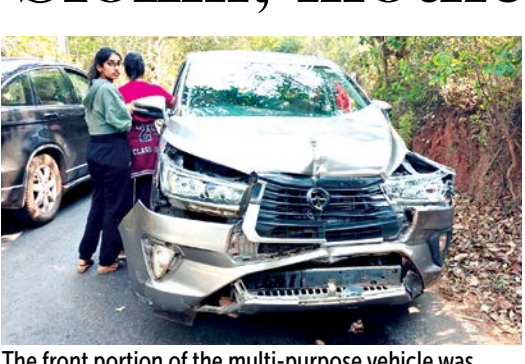
The front portion of the multi-purpose vehicle was completely damaged