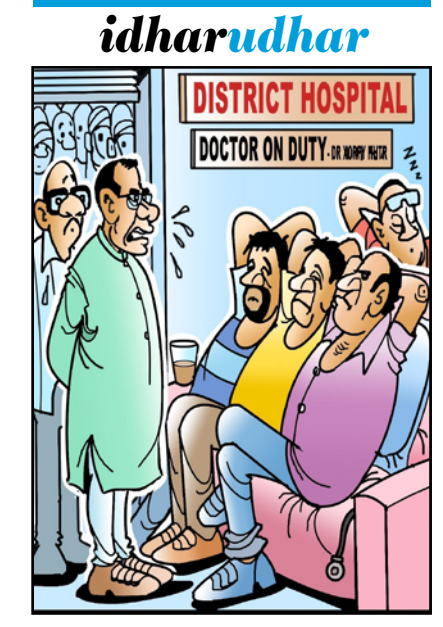
May I know which one of you is the doctor?