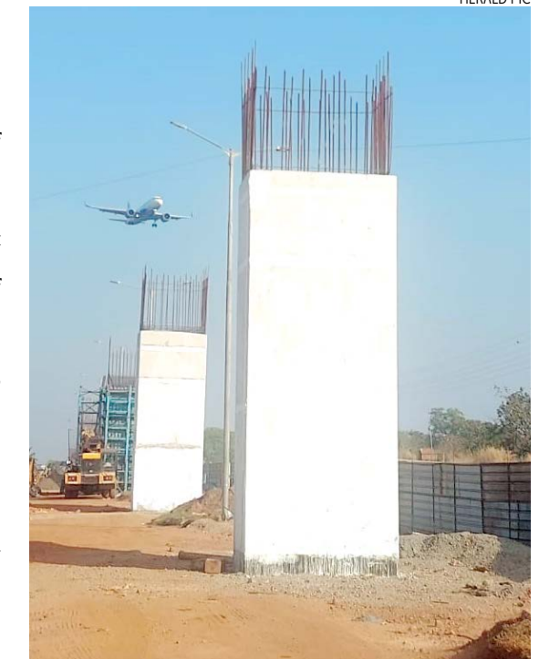
FLIGHT OF PERIL: With pillars built above the prescribed nine metres, landing at Dabolim airport will lead to safety red flags if the flyover is completed

The permission from the Navy is essential can be seen on Page No. 79, point 6 of the Ministry of Civil Aviation Notification of September 30, 2015, which states: "The following steps shall be taken for calculating the maximum permissible heights for cases where