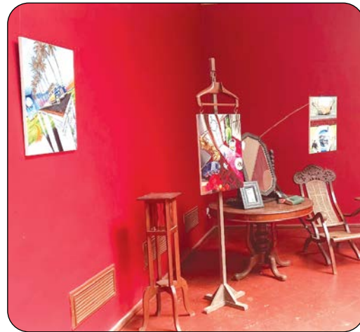
A RETURN TO ART

this issue and then it gets worse. He adds, "In the surgical department, we get at least one a month without fail. We have to deal with the effects of alcoholism like cirrhosis of the liver. The woman's liver weighs around 950 grams in comparison to that of a man which weighs around a kilo and a half. The alcohol can affect a woman's liver very fast." He said it was difficult to get figures because women would not come out. If there was a medical emergency and when an investigation was conducted then it would come out that the woman was an alcoholic.