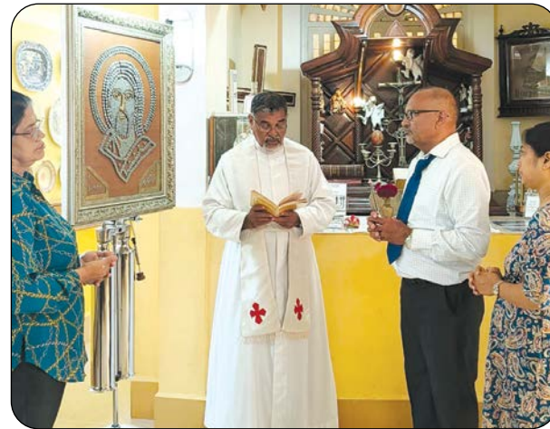
AN INIMITABLE PIECE OF ART AT VARCA