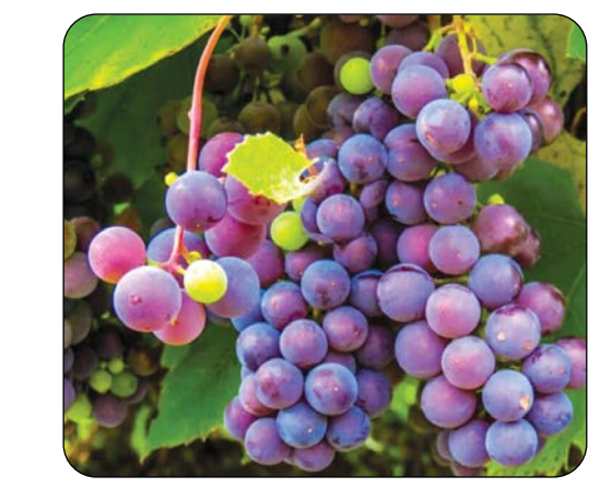
NEED STRONG MUSCLES? EATING GRAPES COULD BOOST MUSCLE HEALTH