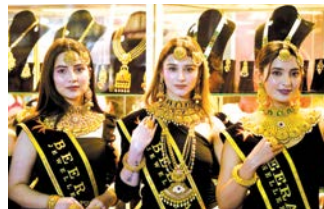
Models wearing jewellery pose for photographs during a jewellery exhibition DJGF Signature 2025, at Bharat Mandapam, in New Delhi