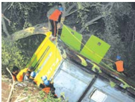
Rescue operation underway after a bus returning from Mata Vaishno Devi shrine skidded off the road and plunged into a 30-foot gorge, in Jammu