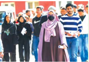
Students come out of an examination centre after appearing in the JKPCS KAS Prelims examination, in Jammu