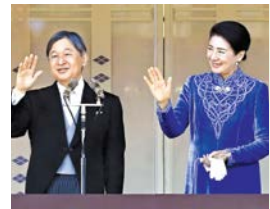
Japanese Emperor Naruhito, left, accompanied by Empress Masako (R), waves to well-wishers from the balcony of the Imperial Palace in Tokyo on his 65th birthday