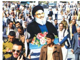
Houthi mourners hold a picture of Lebanon's former Hezbollah leaders, Hassan Nasrallah, during an absent funeral prayers in Sanaa, Yemen