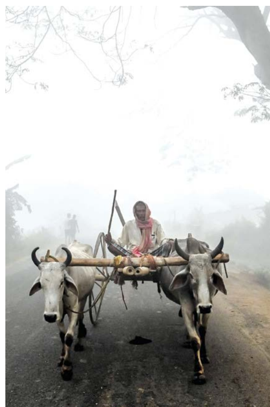
A man rides a cart on a foggy day, in Nadia, West Bengal

PALGHAR: A 16-year-old girl was allegedly drugged and raped by her boyfriend at a birthday party in Maharashtra's Palghar district, police said on Sunday. Based on a complaint, the Virar police on Friday registered a case against the accused under sections 123 (causing hurt using poison, etc. with intent to commit an offence) and 65(1) (rape of woman under 16 years of age) of the Bharatiya Nyaya Sanhita and Protection of Children from Sexual Offences (POCSO) Act, an official said. The complainant has alleged that the accused took her to the birthday party of a common friend on the evening of January 2 and offered her cake and drinks laced with sedatives, he said. The official said the teen fell unconscious and was allegedly raped by the accused in the bedroom of their friend's house. The girl recently found out that she was pregnant due to the assault and lodged a complaint. No arrest has been made, and a probe is underway, he added.