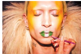
A makeup artist works backstage prior to the start of the Agatha Ruiz de la Prada fashion show during Fashion Week in Madrid, Spain