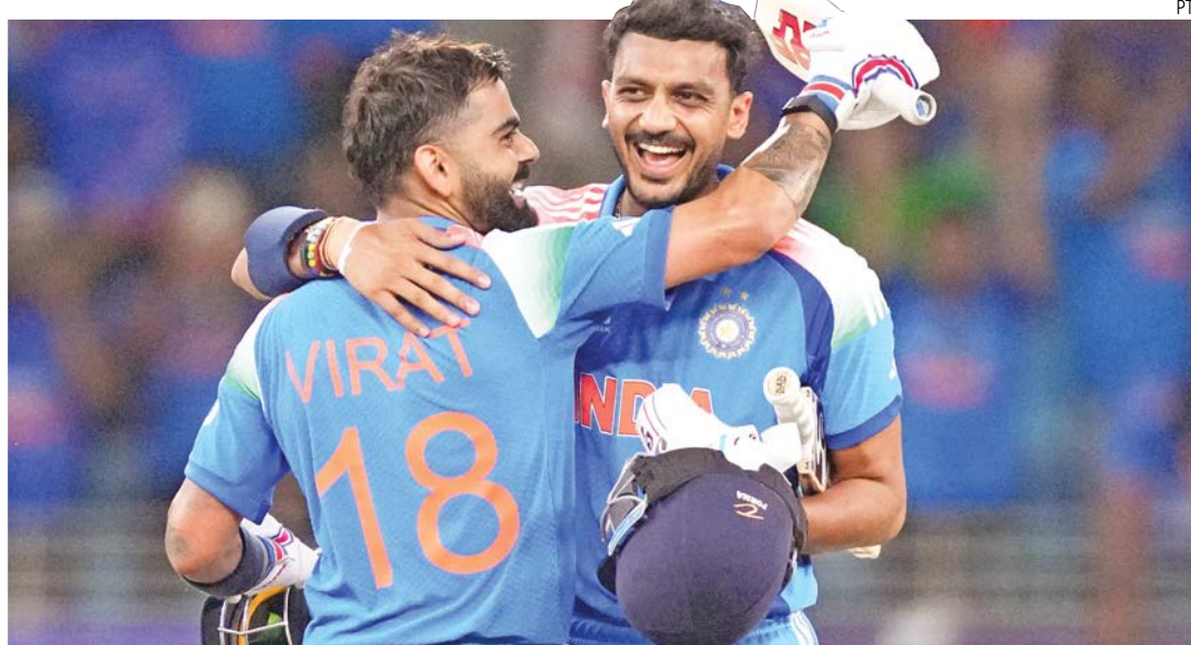
Virat Kohli, left, and Axar Patel celebrate after winning the ODI cricket match of the ICC Champions Trophy between India and Pakistan, at Dubai International Cricket Stadium, in Dubai, UAE, on Sunday