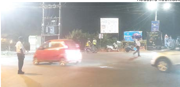
Traffic police conducting midnight checks at Anjuna junction

"My son's Class X exams start on March 1 and it is sad that music can be heard till early morning. There seems to be no respite even during days of examination. Despite putting up with all the noise during the study holidays, we didn't expect them to carry on