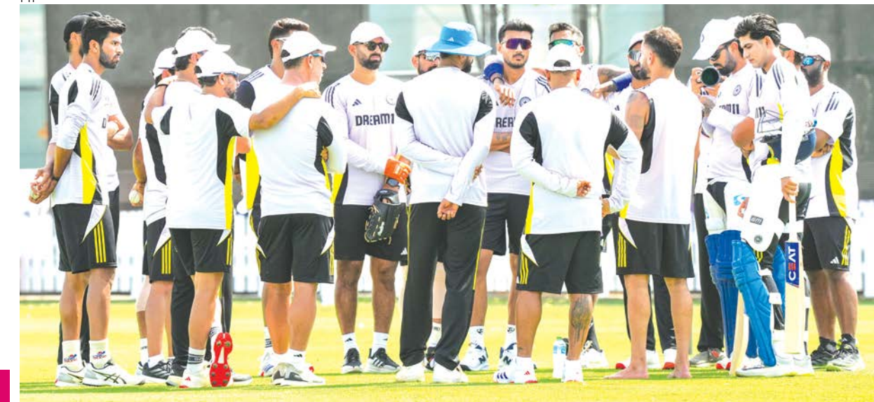
Indian cricketers during a practice session ahead of the ICC Champions Trophy match against Pakistan, in Dubai, UAE, on Saturday

More often than not, an India-Pakistan clash is as much a battle of nerves as cricketing abilities and India would be in a much better space on both counts come Sunday afternoon.