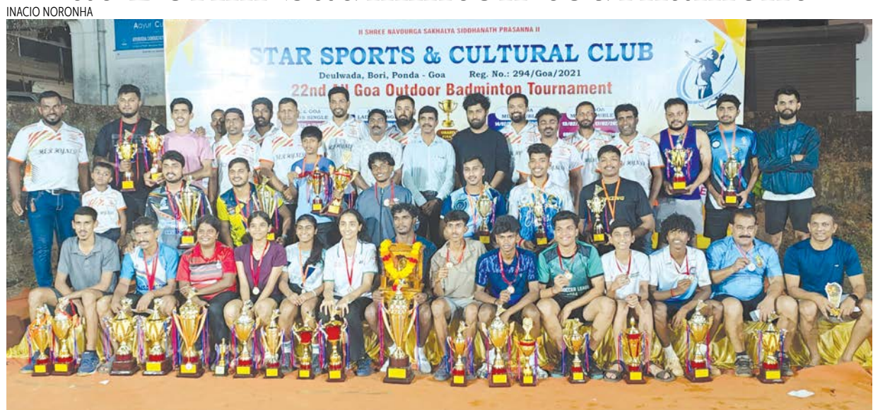
The winners along with the dignitaries at the Kalmamoll badminton court, Borim, recently