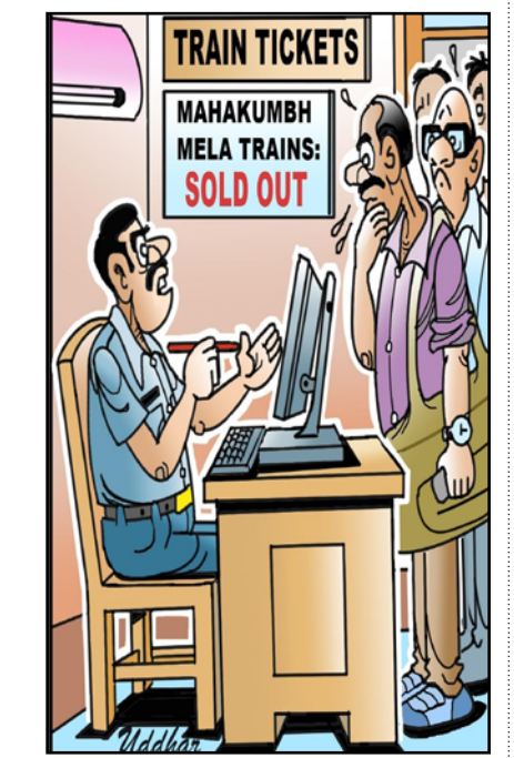
Sitting & standing sold out, would you mind hanging?