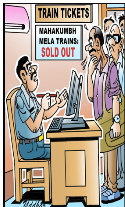
Sitting & standing sold out, would you mind hanging?