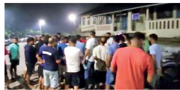
(Top) Mandrem locals gathered at the police station; (below) The car which was involved in the accident