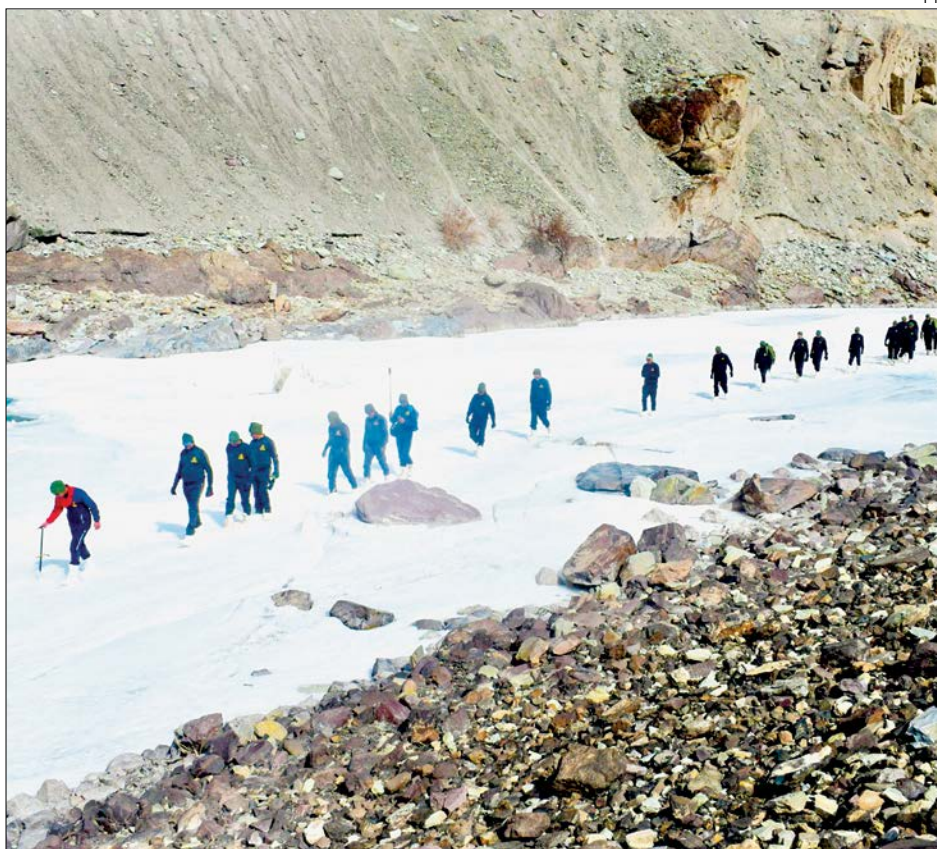
Indian Army personnel undertake a trek on the frozen Zaskar river, Ladakh.