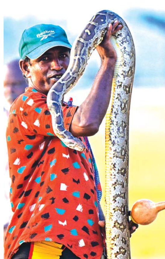
A snake charmer holds a python at the Galle Face promenade in Colombo, Sri Lanka