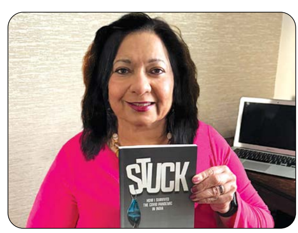
BRAVING THE COVID LOCKDOWN AWAY FROM HOME