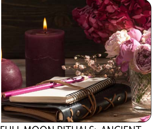
FULL MOON RITUALS: ANCIENT PRACTICES THAT HELP YOU REFLECT AND RESET