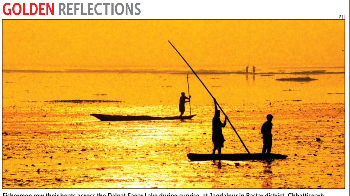
Fishermen row their boats across the Dalpat Sagar Lake during sunrise, at Jagdalpur in Bastar district, Chhattisgarh

have been taken by the Odthe KIIT institute to address lese authorities. Pursuant to our outreach, several steps isha government as well as the situation." he said