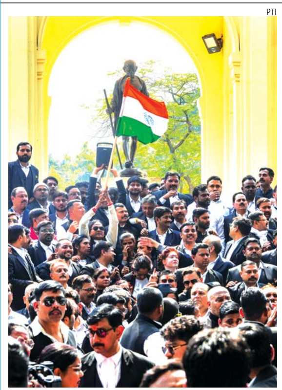
Lawyers shout slogans during a protest march over the proposed Advocates (Amendment) Bill, 2025, in Lucknow