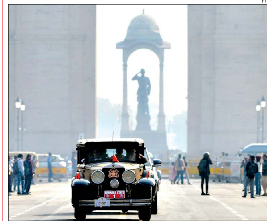
Participants during the 21 Gun Salute Vintage Car rally, at Kartavya Path in New Delhi, on Friday