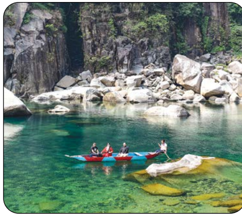
EXPLORING THE NORTHEAST: WHY THESE SEVEN STATES SHOULD BE ON YOUR TRAVEL LIST