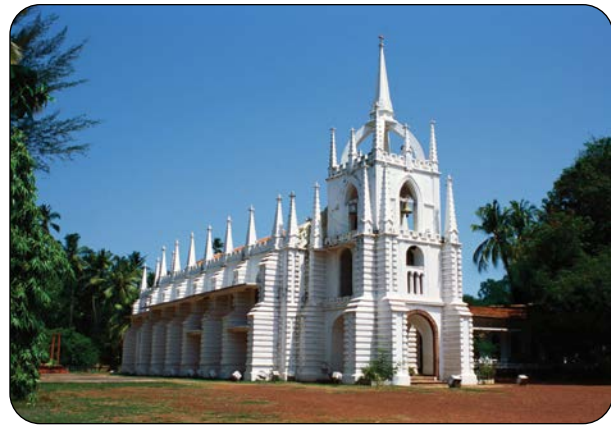
SALIGAO ASSOCIATION, MUMBAI, CELEBRATES ANNUAL FIESTA