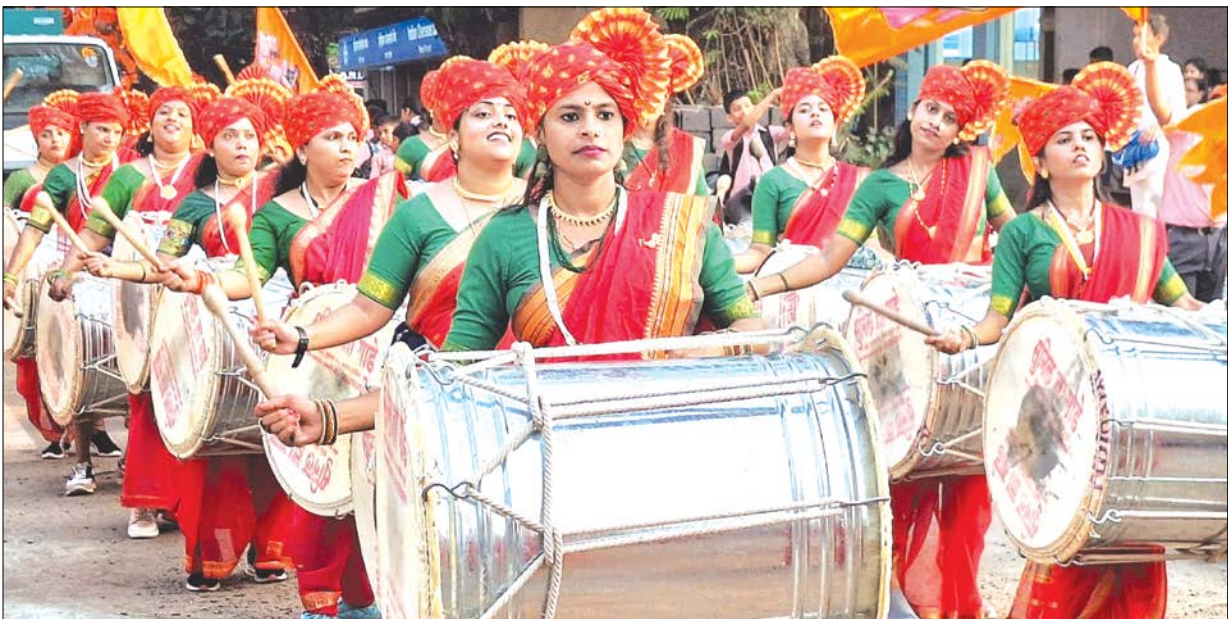
Members of the Mahalaxmi Dhol Tasha Sanskrutik Mandal, Panjim, perform during the Shivjayanti celebrations at the grand procession held in Panjim on Wednesday. Earlier in the day, Chief Minister Dr Pramod Sawant attended the celebrations at Farmagudi, Ponda