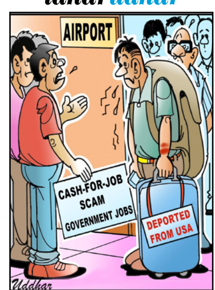
You should've paid for a govt job instead — like us!