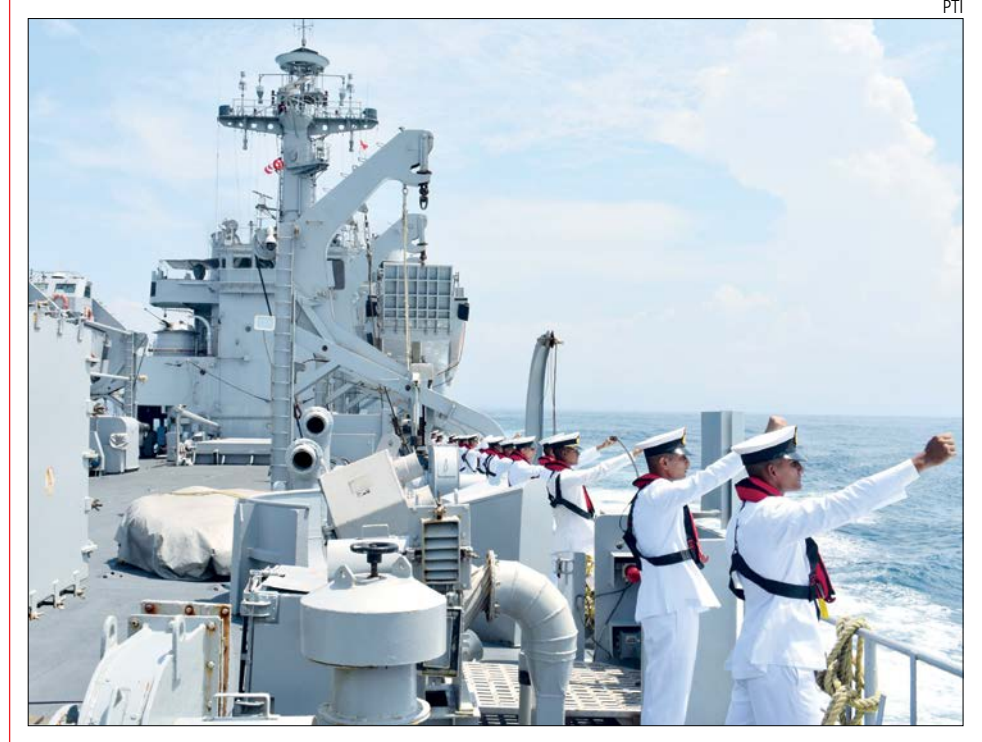
INS Shardul represented the Indian Navy at the International Fleet Review held at Benoa port anchorage in Bali, Indonesia, on Wednesday