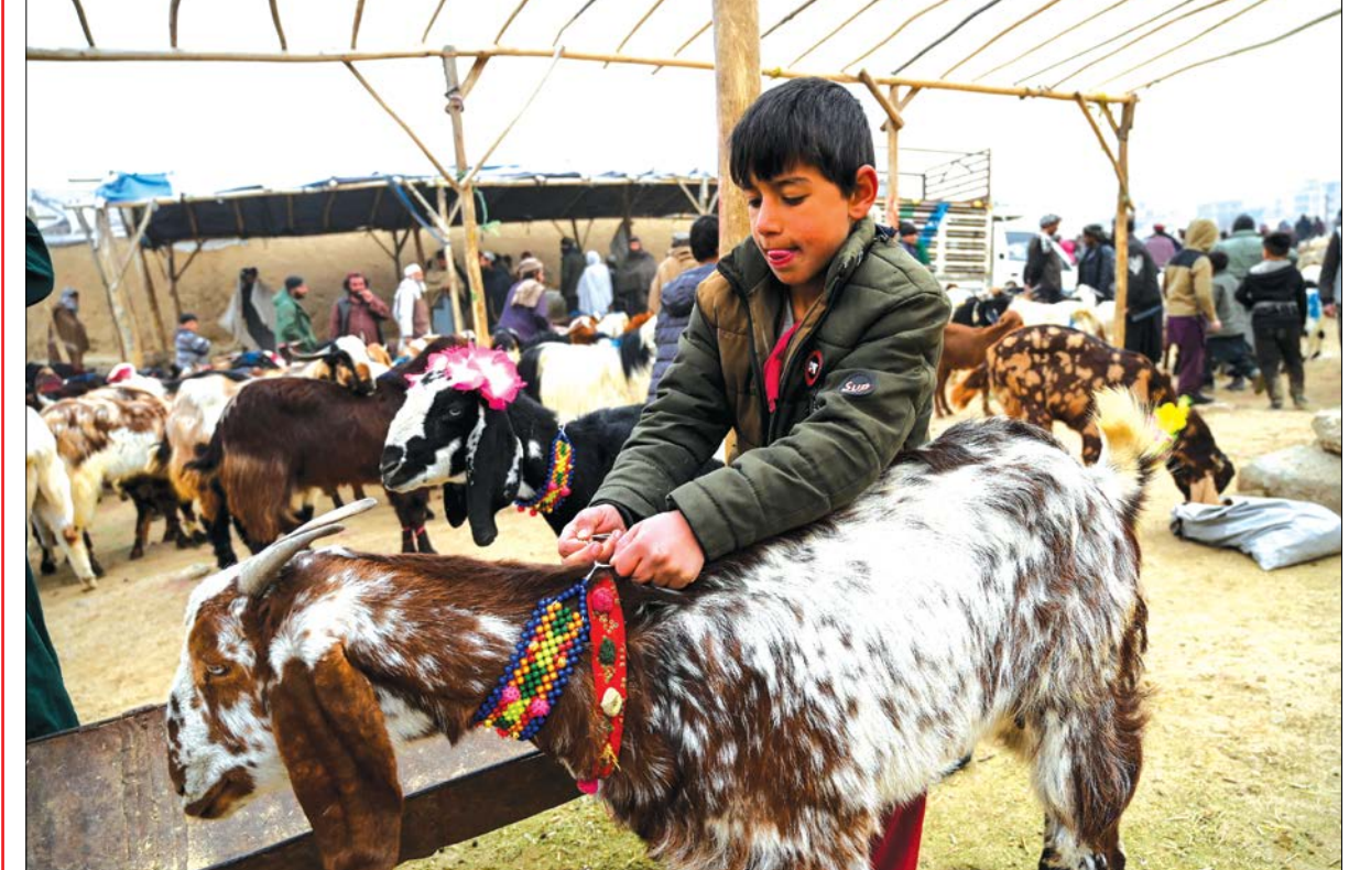
Afghan shepherds gather at a livestock market on the outskirts of Kabul, on Tuesday