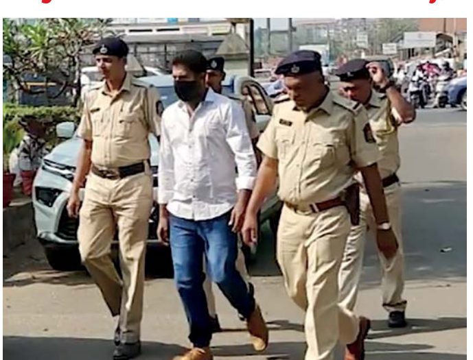
Court sources said Bhagat seemed unbothered and without remorse on being convicted for the brutal rape-murder

Medical evidence played a crucial role in establishing the violent nature of the crime. The post-mortem examination revealed 31 external injuries on McLaughlin's body, with the court noting they were "caused by blunt force impact and were ante-mortem in nature." The presence of injuries in the genital areas of both the victim and