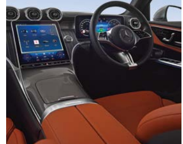
ELEGANT INTERIORS WITH AMBIENT LIGHTING

Now drive home the GLC with 7.49% ROI and Celebratory Benefits. Also avail Depreciation Benefits.