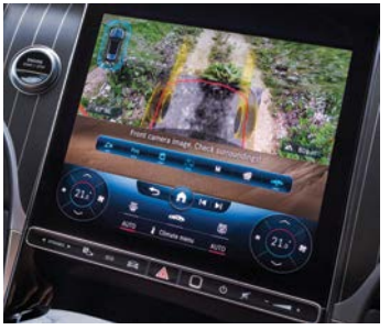
OFF-ROAD ENGINEERING PACKAGE WITH TRANSPARENT BONNET