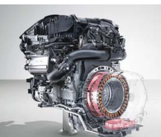
POWERFUL ENGINE WITH 258 hp AND 400 Nm TORQUE