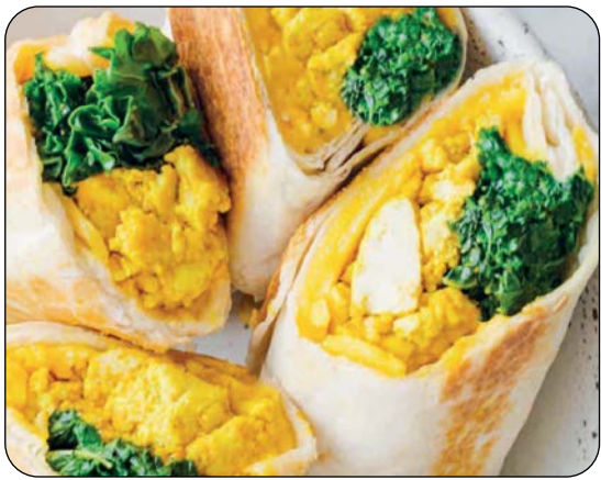
TOFU: AN OPTION FOR BREAKFAST