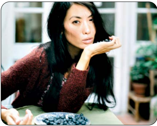
WINTER FOODS FOR GLOWING SKIN