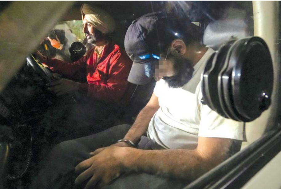
Indians deported from the US being escorted by the police as they leave the airport upon their arrival, in Amritsar, early Sunday

SGPC officials, who were deputed for providing 'langar' and bus service for depor-