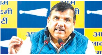
AAP MP Sanjay Singh addresses a press conference, in New Delhi