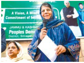
Former CM of Jammu and Kashmir and Peoples Democratic Party (PDP) President Mehbooba Mufti addresses party workers' convention, in Srinagar