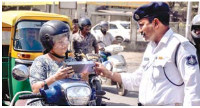
A traffic police personnel gives a gift to a bike rider for wearing a helmet, in Surat