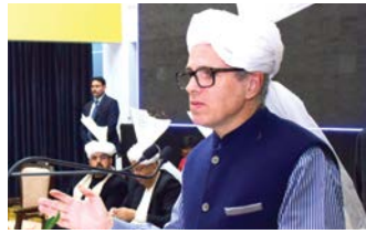
Jammu and Kashmir Chief Minister Omar Abdullah addresses during the felicitation ceremony, in Jammu