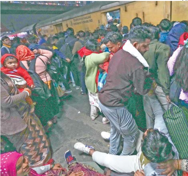
A man falls amid a huge rush of passengers for boarding an overcrowded train for Prayagraj's Mahakumbh, at the New Delhi railway station, Saturday

As survivors recalled how people trampled over each other amid cries for help, the Delhi Police said it will analyse the CCTV footage to determine the exact sequence of events before chaos erupted at the station on Saturday night. The station wit-