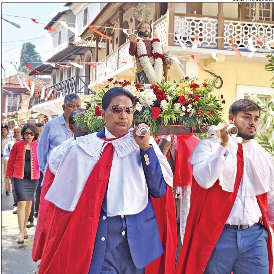
The statue of St Thomas being taken out in a procession on the occasion of the Saint's feast at Sao Tome chapel, Panjim, on Sunday