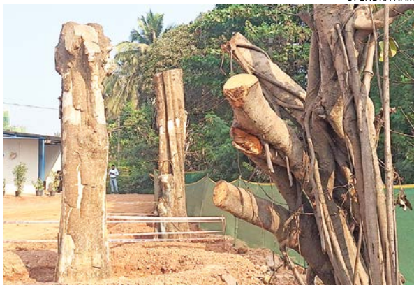
The age-old trees, including a banyan, which were translocated from Porvorim for the six-lane elevated corridor project, are now struggling to survive and displaying signs of distress. The trees have been replanted outside a company office in Socorro

According to social activist and environmentalist Aver-