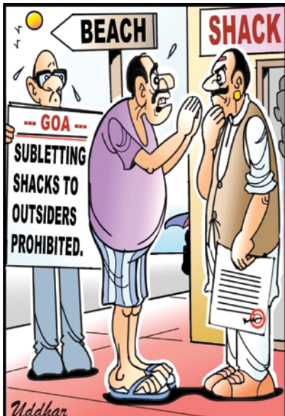
Can you sublet my shack back to me? I'm a Goan!