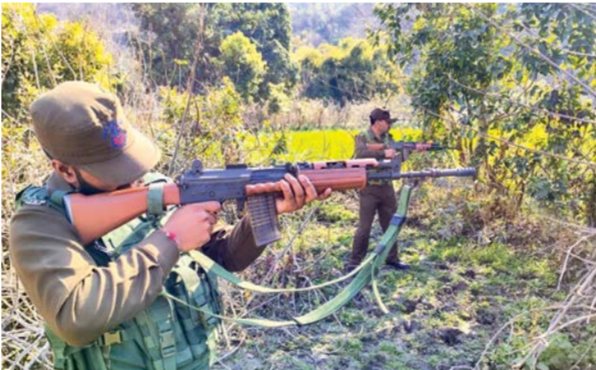
Security personnel during a search operation near LoC forest area, in Akhnoor sector in Jammu

The officials said the LG invoked Article 311 (2) (c) of the Constitution to terminate the services of the three employees after investigation by law enforcement and intelligence agencies clearly established their terror links.