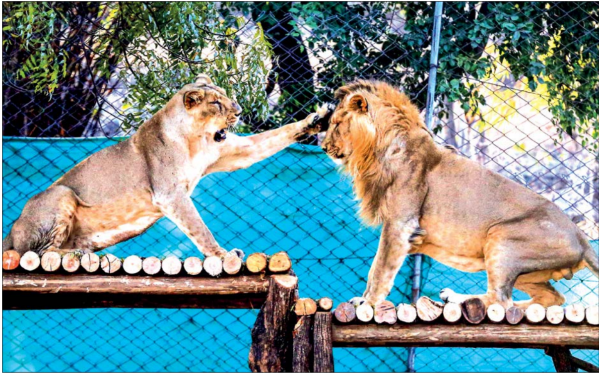
A pair of Asiatic lions inside their enclosure, at Van Vihar National Park in Bhopal, Madhya Pradesh

His mother was in tears when she came to know about the deportation of her son.