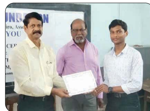
STUDENTS OF ASSOLNA AWARDED FOR THEIR ACADEMIC EXCELLENCE