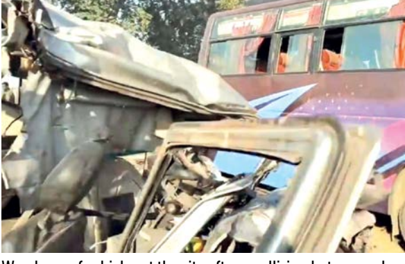
Wreckage of vehicles at the site after a collision between a bus and a car on the Mirzapur-Prayagraj highway

All the 10 people travelling in the Bolero died in the accident, while those in the bus suffered minor injuries, the DCP said.