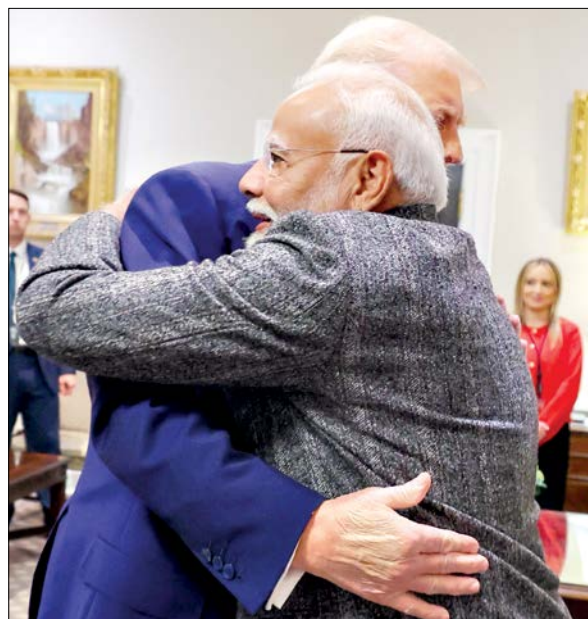
PM Modi hugs US President Donald Trump at the White House