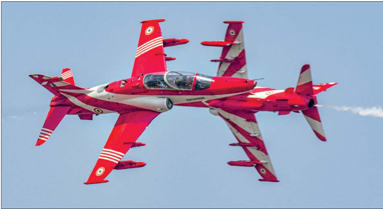
IAF's aerobatic team Surya Kiran performs on the last day of Aero India 2025, at Yelahanka Airbase in Bengaluru, on Friday