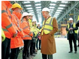
Britain's King Charles III reacts as he meets workers and apprentices during a visit to SeAH Wind's offshore turbine factory, in Middlesbrough, north east England