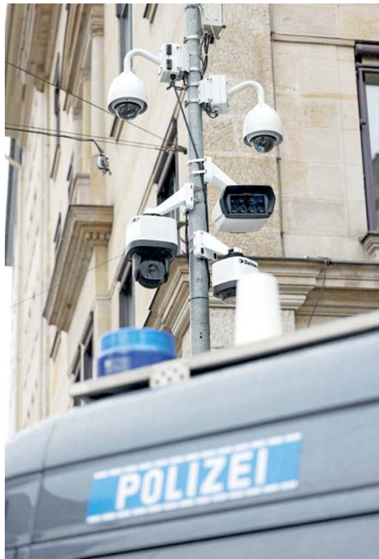
Video surveillance cameras are pictured next to a police car in the area of the Hotel Bayerischer Hof, the venue of the Munich Security Conference (MSC), in the center of Munich, southern Germany, one day before the start of the conference. The Munich Security Conference (MSC) runs until February 16, 2025