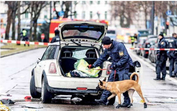
Emergency services attend the scene of an accident after a driver hit a group of people in Munich, Germany

Participants in a demonstration by the service workers' union ver.di were walking along a street at about 10.30 am when the