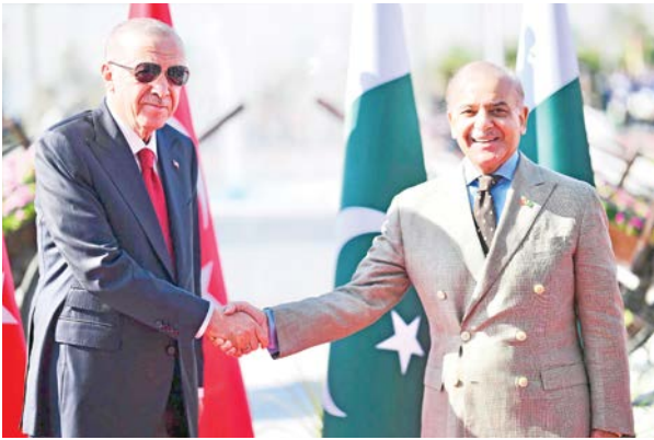
Visiting Turkish President Recep Tayyip Erdogan greets Pakistan's Prime Minister Shehbaz Sharif during a welcome ceremony, in Islamabad, Pakistan

be addressed according to the UN resolution through dialogue and keeping in mind the aspirations of the people of Kashmir, Erdogan said.