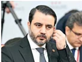
Syria's Minister of Foreign Affairs Asaad Hassan al-Shaibani (L) attends the International Conference on Syria at the Ministerial Conference Center, in Paris