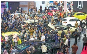
Visitors look at vehicles during the Indonesian International Motor Show in Jakarta, Indonesia