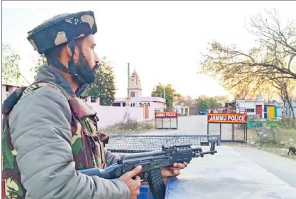
A security personnel keeps vigil during a search operation after a suspected IED blast that killed two army personnel, in Akhnoor, Jammu and Kashmir

"Directed officials to follow zero tolerance policy