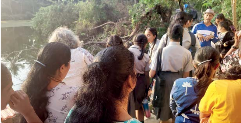
Students and locals during the educational programme exploring the vital pond ecosystem of Chicalim

The programme underscored the vital link between local communities and sustainable resource