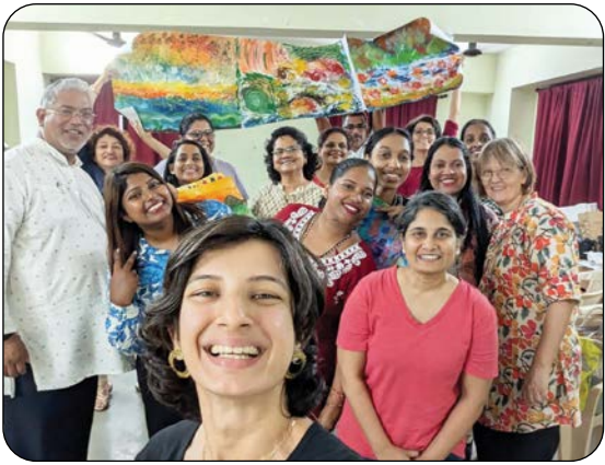
HEALING BY THE BRUSH STROKES