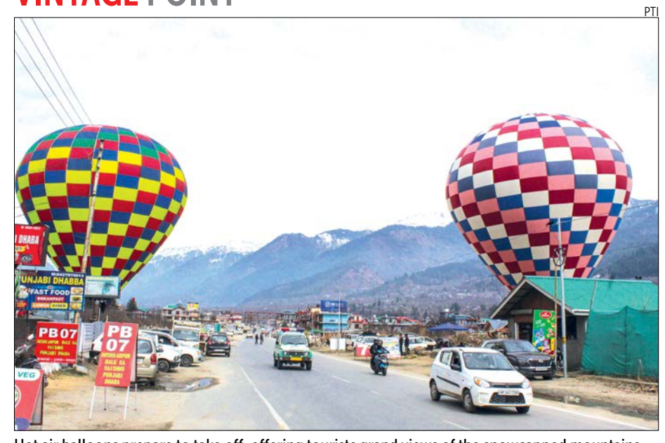
Hot air balloons prepare to take off, offering tourists grand views of the snowcapped mountains,