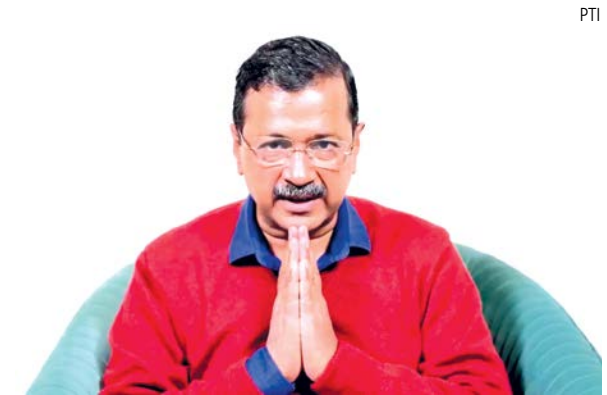
AAP convenor Arvind Kejriwal reacts on Delhi Assembly polls

The INDIA bloc was formed in the run-up to the Lok Sabha polls with parties, often at loggerheads with each other in states, coming together with the sole objective of defeating the BJP that seemed primed to better its previ-