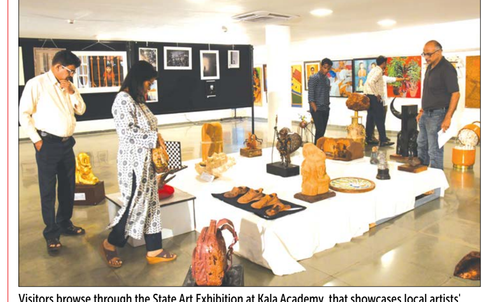
Visitors browse through the State Art Exhibition at Kala Academy, that showcases local artists' creative talents and providing a platform for artistic expression

The exams will be held across 20 centers in the State. The examination will begin at 9:30 am for all streams including Arts, Commerce, Science and Vocational. Candidates are advised to be present at the examination centre at least 45 minutes before the commencement of the exam.