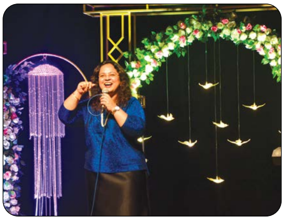
WORLD CANCER DAY CELEBRATED WITH A MISSION OF HOPE