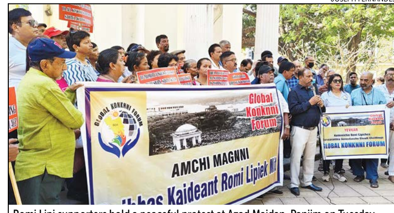
Romi Lipi supporters hold a peaceful protest at Azad Maidan, Panjim on Tuesday

solely on Devanagari, it neglects works in Romi and Kannada, both of which hold deep cultural