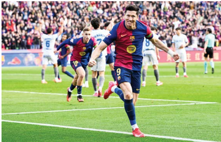
FC Barcelona's Polish forward #09 Robert Lewandowski (right) celebrates scoring their first goal during the Spanish league match against Deportivo Alaves at the Estadi Olimpic Lluis Companys in Barcelona

One mazy Lamine Yamal dribble got home fans excited but there was little else to raise the pulse.