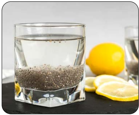
THE TRENDY CHIA SEEDS GOES BACK TO ANCIENT CIVILISATIONS