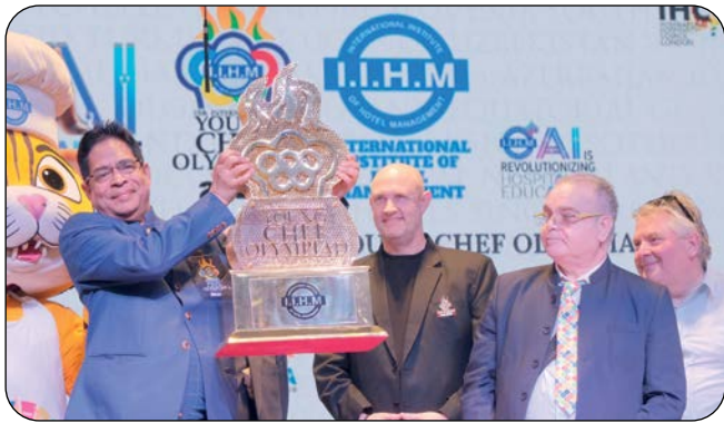
YOUNG CHEF OLYMPIAD 2025 OPENS WITH A GLITTERING CEREMONY ON THE BANKS OF THE MANDOVI