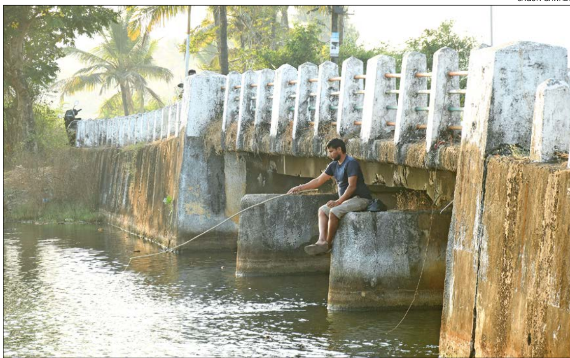
An angler dangerously sits on a pier of a culvert along the Santa Cruz-Taleigao road