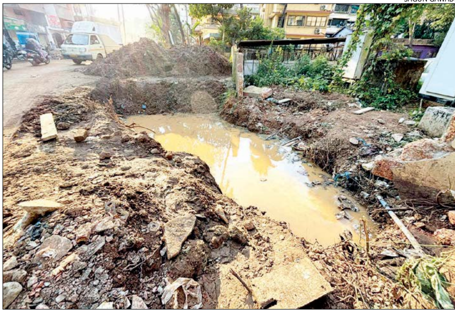
Work along the pipeline supplying water to Taleigao and Dona Paula, which burst on Sunday, is currently underway at Bhatlem

Meanwhile, Imagine Panaji Smart City Development Ltd (IPSCDL) has clarified that the pipeline