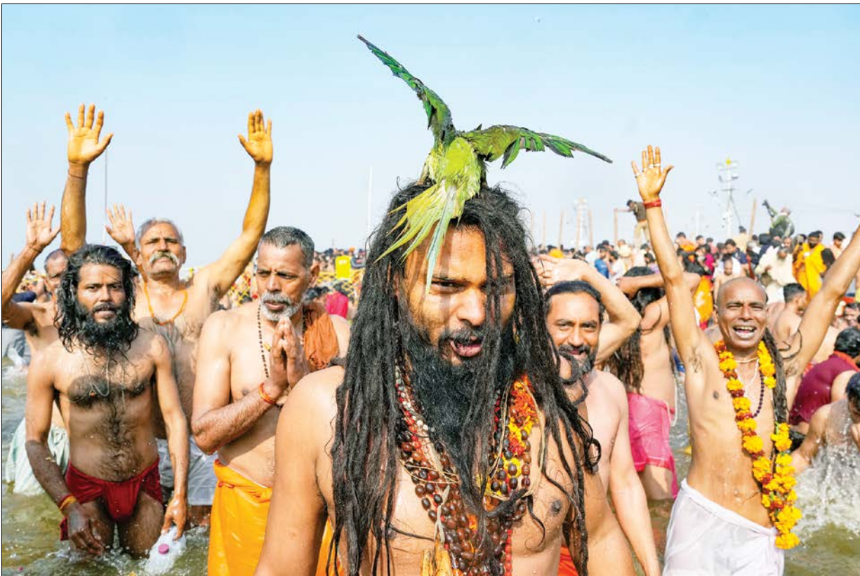
'Sadhus' take a holy dip at the Sangam on the occasion of Basant Panchami during the ongoing Kumbh Mela, in Prayagraj, on Monday