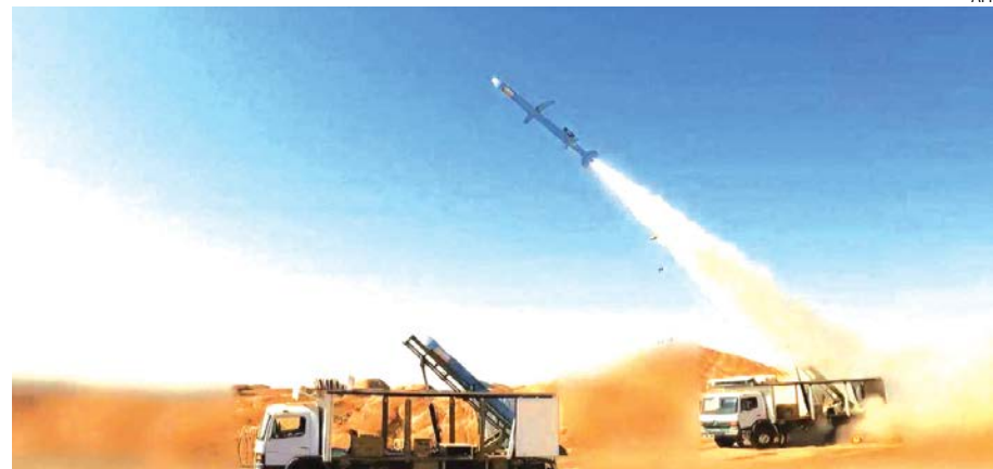
A test launch during the unveiling of the Ghadr-380 naval cruise missile in an undisclosed location in Iran. The naval arm of the IRGC unveiled a new underground missile facility on the south coast in footage aired by state television on February 1, two weeks after unveiling an underground naval base

The report said the new weapon was a sophisticated missile, without elaborating, which could be launched from the under-