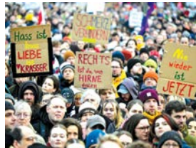
Protesters display placards as they take part in a demonstration under the motto 'Loud against Nazis' in front of the Reichstag building in Berlin