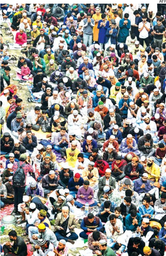
Muslim devotees take part in 'Akheri Munajat' or final prayers during 'Biswa Ijtema', an annual gathering of Muslims, in Tongi on the outskirts of Dhaka

Dozens of migrants leave Albania after Italian court ruling SHËNGJIN, (ALBANIA): Dozens of migrants left Italian-run facilities in Albania on Saturday after judges in Rome refused to approve their detention, in another setback for Prime Minister Giorgia Meloni. An Italian boat carrying 43 migrants departed from the Albanian port of Shengjin for the Italian port of Bari, according to an AFP journalist. The migrants arrived in Albania on Tuesday, the third group transferred under Italy's effort to outsource migrant processing to a non-EU country and speed up repatriations of failed asylum seekers. Other European nations are watching the scheme closely, but it has been heavily criticised by rights groups and has faced repeated holdups. No migrant has spent more than a few days at the centre in Albania.