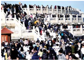
A crowd climb the stairs at the Hall of Prayer for Good Harvests in the Temple of Heaven complex during a week-long Chinese New Year holiday in Beijing