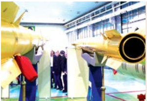
President Masoud Pezeshkian visits an exhibition of the defense ministry's latest defense and space achievements, in Tehran, Iran