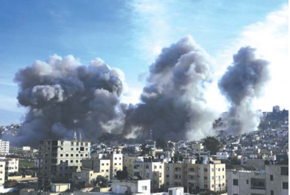
Smoke rises following an explosion detonated by the Israeli army, which said it was destroying buildings used by Palestinian militants in the West Bank Jenin refugee camp

"Minutes later another drone strike in Jenin killed two more youths who were on a motorcycle."