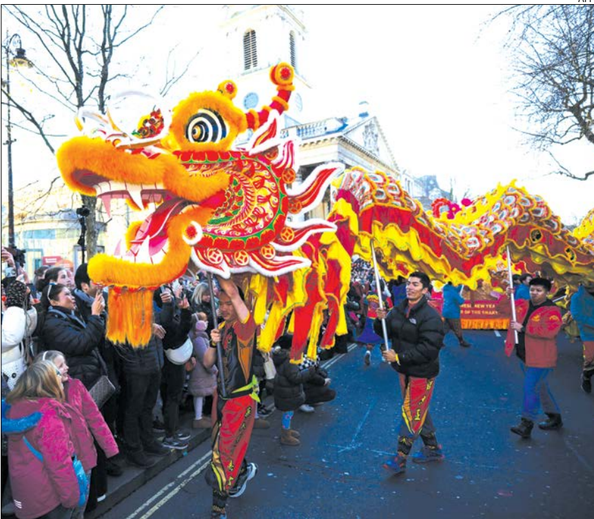
A dragon dance is performed during the parade to celebrate the lunar new year at China Town, in London