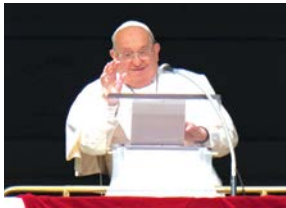
Pope Francis delivers his blessing as he recites the Angelus noon prayer from the window of his studio overlooking St Peter's Square, at the Vatican