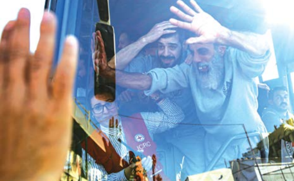
Freed Palestinian prisoners wave from a bus as they arrive in the Gaza Strip after being released from an Israeli prison following a ceasefire agreement between Hamas and Israel in Khan Younis

Palestinian health authorities in Gaza also announced that the long-shut-