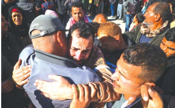
Palestinians who were imprisoned by Israel are welcomed by family and friends upon arrival to the European Hospital in Khan Yunis for check ups

of Israeli Prime Minister Benjamin Netanyahu says he spoke Saturday evening with President Donald Trump's special envoy for the Middle East, Steve Witkoff. They agreed that negotiations on the Gaza ceasefire's second phase will begin at their meeting Monday in Washington. Netanyahu leaves Sunday