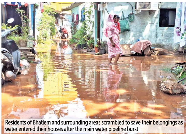
Residents of Bhatlem and surrounding areas scrambled to save their belongings as water entered their houses after the main water pipeline burst

NOBODY VISITED US TO FIND OUT WHAT HAPPENED: LOCAL