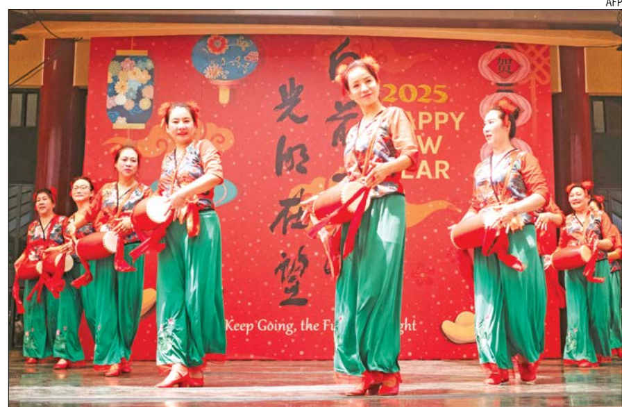
A traditional Chinese dance group performs during the Chinese Lunar New Year celebrations at the Buddhist Nan Hua Temple in Bronkhorstspuit, South Africa, on Sunday. The Chinese community in South Africa, the largest in Africa, welcomes the Year of the Wood Snake with cultural celebrations and traditional festivities