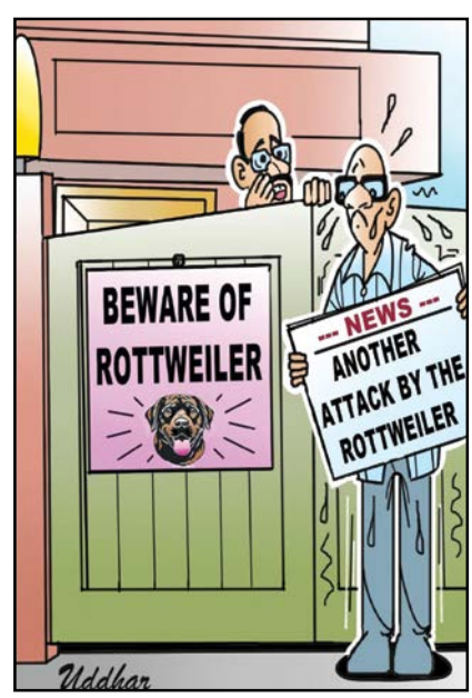
Just to scare burglars - I don't have any