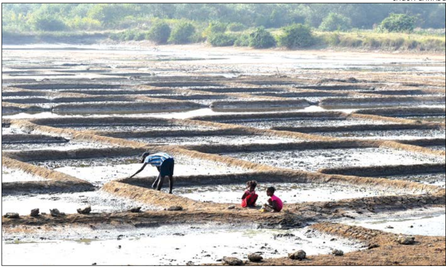
Children pass their time while their father repairs the cracks in a salt pan at Curca