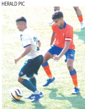
Mumbai City FC player tries to shield the ball from FC Goa player in the Reliance Foundation Development League U-21 match at Duler Stadium, Mapusa, on Friday