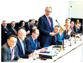
Friedrich Merz, German Opposition leader speaks in a meeting, in the German parliament Bundestag, Berlin, in Germany