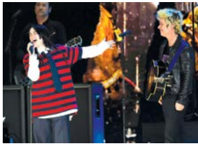
Billie Eilish (L), performs with Billie Joe Armstrong of Green Day during the FireAid benefit concert, at The Forum in Inglewood, California