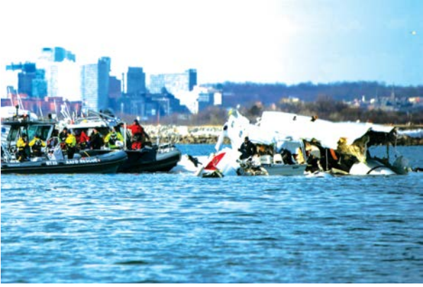
Wreckage is seen in the Potomac River near Ronald Reagan Washington National Airport, in Washington

Investigators have already recovered the cockpit voice recorder and flight data