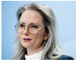
Dy PM of the Netherlands Fleur Agema delivers remarks during a press conference after the weekly ministers' cabinet meeting, in The Hague