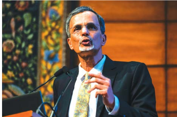
Chief Economic Advisor V Anantha Nageswaran addresses a press conference in New Delhi, on Friday

Effective government policies also means changing the operating principle of regulations from 'guilty until proven innocent' to 'innocent until proven