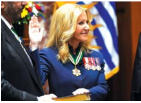
Wendy Cocchia is sworn in as British Columbia's 31st lieutenant governor during her installation ceremony at the BC Legislature in Victoria, BC