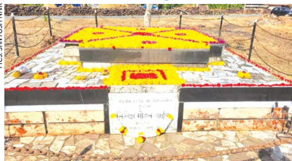
Memorial of Nileshe Naik, who was martyred in Nylon 6,6 agitation

ing the 1995-96 protests against the Nylon 6,6 project, one villager, Nileshe Naik, was killed in police firing. Following intense resistance, the project was scrapped. In 2007, locals strongly opposed handing over the same land for the Cipla SEZ project and even approached the courts to reclaim it.