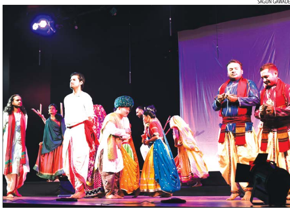
Artists performing the drama Mai Ri Main Ka Se Kahun at Kala Academy, Campal, organised by the Directorate of Art and Culture in collaboration with the National School of Drama, New Delhi